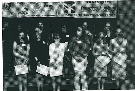
Statewide winners of the 2001-02 essay contest are honored at an awards ceremony held at the Ramada Plaza Hotel in Meriden, CT.

With generous funding from the John Templeton Foundation, SEE introduced Connecticut's Laws of Life program in 2000. Laws of Life is a unique character-education initiative that gives students in grades 6-12 the invaluable opportunity to reflect on and write about their "laws of life" – values and ethics that they believe will help them live successful and productive lives.