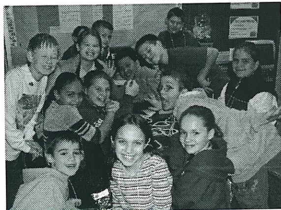
BEC students celebrate their service to a local senior living facility.