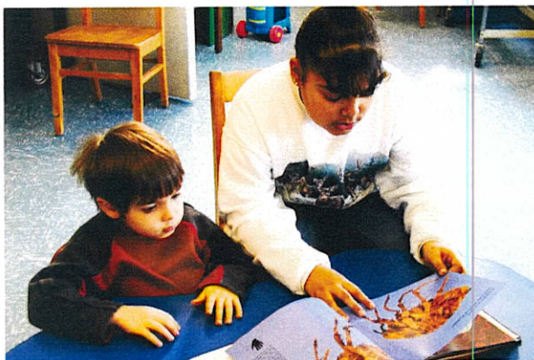
Hockanm fifth-grader working with a buddy.