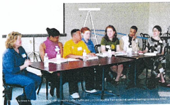
SASL students and sponsors at Service-Learning Showcase.

In addition, SEE staff provide technical assistance to each team by contacting the adult leader at least once a month and offering to visit with the team during site visits once during their project work.