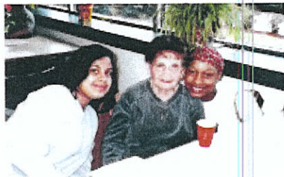
Students from Common Ground High School with Casa Otonal resident (March 2004)

on three occasions to interview the seniors about their memories of the Caribbean, their experience in coming to the United States and life since arriving in this country. The students then drafted, revised and finalized both English- and Spanish-language histories of the seniors and prepared the stories for publication in a collected volume. During a final visit to Casa Otonal, the students presented their stories and celebrated with the seniors with games and food the students had prepared for the occasion.