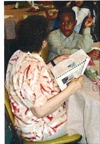
Student author reviews biography with senior during YES service-learning project.

In addition, more than 3,100 students wrote essays for SEE's Laws of Life essay program. Laws of Life provides students with the opportunity to reflect and write about the values and principles that they believe will help them live productive lives. The top two essays from each participating school were submitted to SEE for entry in its statewide competition. These essays included the following themes: perseverance, acceptance, forgiveness, respect, honesty, courage, hope, love, friendship and compassion. Parents, teachers and students described a number of positive benefits from participating in this program. According to one parent, "This (essay) was a healing process for our family." A teacher commented: "Parents have told me they were amazed to hear some of the thoughts and feelings their children had expressed, often about difficult situations.... I have found my experience to be inspiring. If you had to measure in terms of "grades," I can tell you that this contest brings about some of the best writing my students have done all year." And a student noted, "This essay helped me realize what is important to me and what kind of person I want to be." For the first time since SEE began its program, Laws of Life became part of the required curricula in several participating schools, demonstrating the significance of the program to area schools.