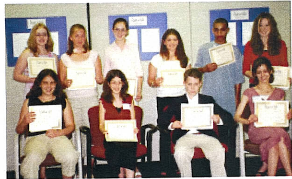
Award-winning essayists in SEE's Laws of Life essay program at reception hosted by the Graustein Foundation.

In the past four years, more than 15,000 students across Connecticut schools have participated in Laws of Life . Each participating school organizes its own contest and submits