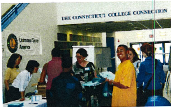
Students registering for Connecticut's Service-Learning Showcase.

In a cost saving effort, SEE discontinued the publication of its newsletter, SEE News. SEE News had expanded its circulation to include schools in Connecticut, Massachusetts and Rhode Island and more than 6,000 subscribers at no charge. Currently, SEE is attempting to build an email data base to mail