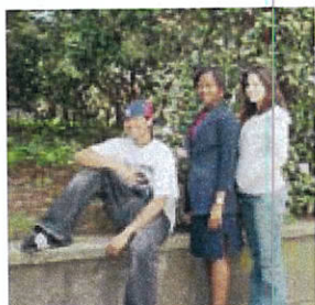
Representatives from SASL board attended CT's Service-Learning Conference at Connecticut College May 17, 2005.

SASL has completed its second school year as a youth-philanthropy board promoting service-learning as a teaching strategy for New Haven County middle and high schools. SASL is a project of SEE's Youth: Ethics in Service program with partial funding by a federal Learn and Serve Grant. High school students from New Haven County schools lead the SASL board. The board was represented by 13 high school students from eight different New Haven county schools. During monthly meetings, the board organized itself to recruit and fund nine projects, which resulted in about 183 students participating in almost 3,000 hours of service-learning and providing service to about 525 people. In