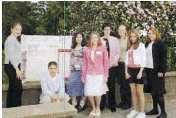
YES Team from Tyrell Middle School in Wolcott, CT gathers after their excellent breakout presentation during Service-Learning Connections at Conn. College (May 17, 2005).

A second breakout session included the presentations by students in elementary, middle and high schools that described practical project ideas and effective planning strategies for service-learning. SEE's Youth: Ethics in Service (YES) team from Tyrell Middle School in Wolcott did an outstanding job communicating their project to create a bully-resistance program at their school. The Tyrell project was noted to include workshops that students presented to peers and younger students in district elementary schools through assembly programs. The research driven project included many explicit learning connections to language arts, health and citizenship.