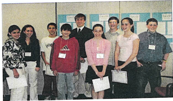
Winners of the 2004-2005 Connecticut's Laws of Life Essay Program were recognized at an awards ceremony in Hamden, Conn. on May 11, 2005.

The School for Ethical Education (SEE) has been administering the Laws of Life Essay Writing Program in the state of Connecticut since 2000. During the 2004-05 school year, 22 schools and 3,784 writers participated in the Laws of Life program. Over the past five years, more than 18,000 students have taken the challenge to reflect and write about the values that might help them live successful lives. Laws of Life provides students with an opportunity to discuss important personal values and publish those personal beliefs within their community of family, peers and their school. Evaluators of the contest have noted that Laws of Life students gain an appreciation of their own personal values and how those values can provide strength, especially when life becomes challenging.