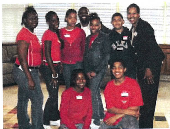
Representatives of GearUp team at the Open the Door Symposium (May 2005).

Almost 90 students attended the Open the Door symposium that was held on May 26.