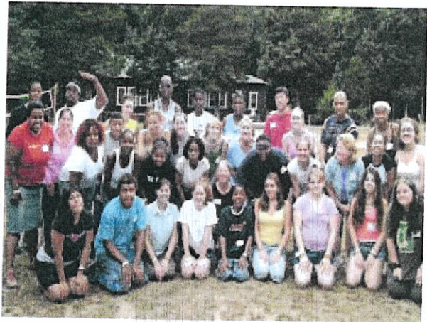
Make a Difference participants (August 9, 2005).

An additional goal of this event was to bring together groups with a variety of causes and objectives. Three members of SEE's Student Activists for Service-Learning attended as a team. Event planners recognized that while the participant groups had different missions, all the teams shared the need to enhance their leadership, project planning and communication with their community. The planning committee also tried to fill a gap for youth groups who are not part of a larger organization. Thus, networking of youth