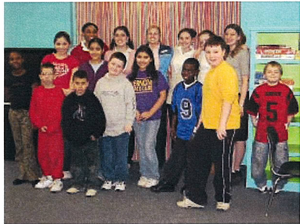
YES service-learning team (back row) with students they served to "Create-a-Space" for an after-school program.

More than 800 students and teachers working in 33 teams participated in service-learning projects and practiced ethical reflection during Youth: Ethics in Service (YES) . The service-learning projects included peer mentoring, outreach to seniors and younger students, peer tutoring, recycling, service to the needy, school improvement and a youth philanthropy board. YES teams were engaged in their projects for an estimated 12,800 hours. SEE created and provided project planning and reflection guides to help students and teachers integrate meaningful individual and team reflection into their projects.