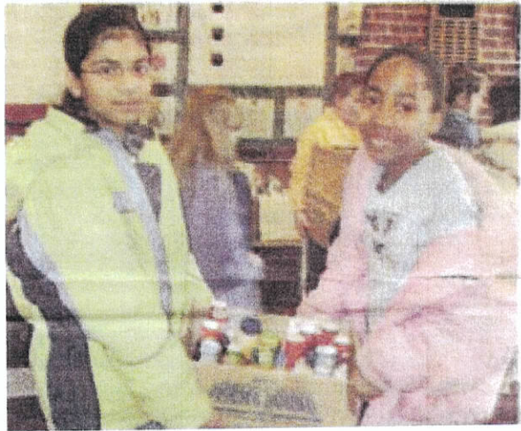
Students use teamwork to move food items to collection location (February, 2005)

Three classes of fourth-grade students at Wapping Elementary School worked together on a service-learning project to support a food drive for the South Windsor Food Bank. The