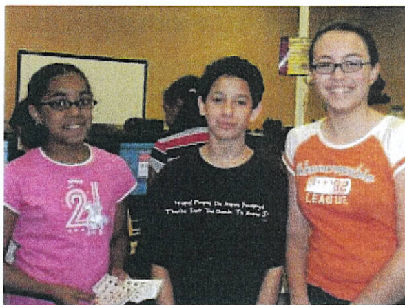
Representatives of the YAR team pause during their successful book swap (2005).

Following YES guidelines, the YAR team developed their plan to organize the book swap, which included: 1. Obtain principal