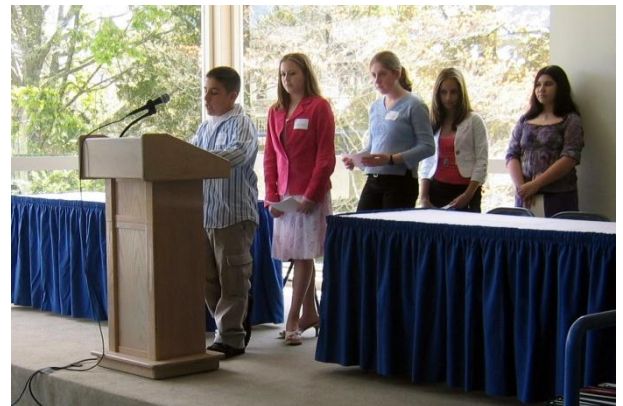
Wolcott Middle School's Character Counts Club presents their project reflections for Connecticut's 2005 Service-Learning Conference.

In addition to this service to their fellow classmates to raise awareness and teach resistance strategies to bullying, the Character Club was able to make presentations to elementary schools in the district as well as present their completed project to teachers and students at the 2005 Connecticut Service-Learning Conference hosted in New London at Connecticut College. The Club presented a poster board of their project as well as describing the process of their work to the teachers and other service-learning student groups at the conference.